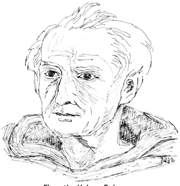
Ebasethe Volpen Delourne

4 FARMER - HELDEM OF OLDEK. Heldem's grandfather fled his native village after being chased of witchcraft. In fact, he wielded some psionic abilities, which were inherited by his offspring. Heldem (27) managed to keep his talents a secret, but now he gets problems with concealing the abilities of his five year old daughter Tamael, who inherited this trait. Heldom's wife Linriola (28) expects her second child in spring and is supported by Heldem's widowed mother Pradia (60), whose other sons (26 and 23) left